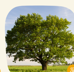
Quercus (many kinds)