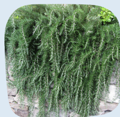
Rosmarinus Officinalis 'Prostratus'