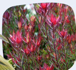
Leucadendron (many kinds)