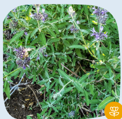
Salvia 'Bee's Bliss'