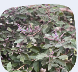
Vitex Trifolia 'Purpurea'