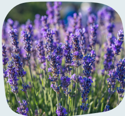
Lavandula (many kinds)