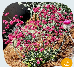
Eriogonum Grande var. Rubescens