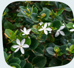
Carissa 'Boxwood Beauty'