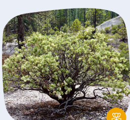
Arctostaphylos (many kinds)