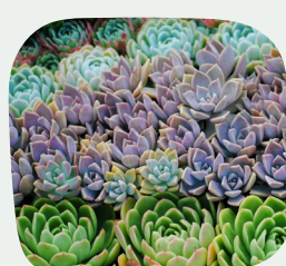
Echeveria (many kinds)