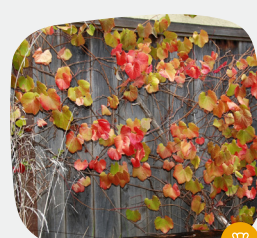
Vitis 'Roger's Red'