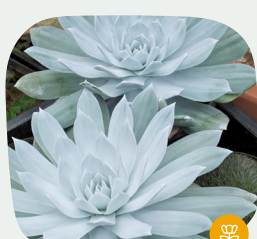
Dudleya (many kinds)