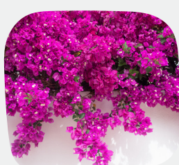
Bougainvillea (many kinds)