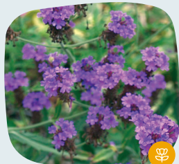
Verbena Lilacina 'De La Mina'