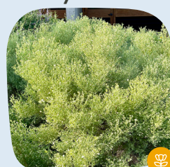
Baccharis Pilularis 'Pigeon Point'