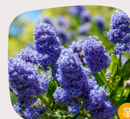
Ceanothus (many kinds)