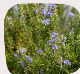
Westringia 'Blue Gem'