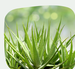
Aloe (many kinds)