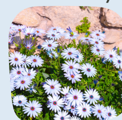
Arctotis (many kinds)