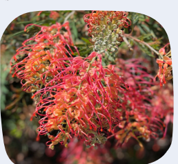
Grevillea (many kinds)