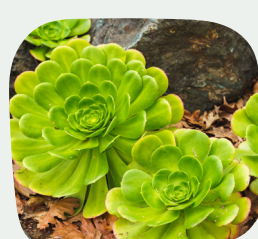
Aeonium (many kinds)