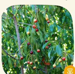
Prunus Ilicifolia/ Lyonii (many kinds)